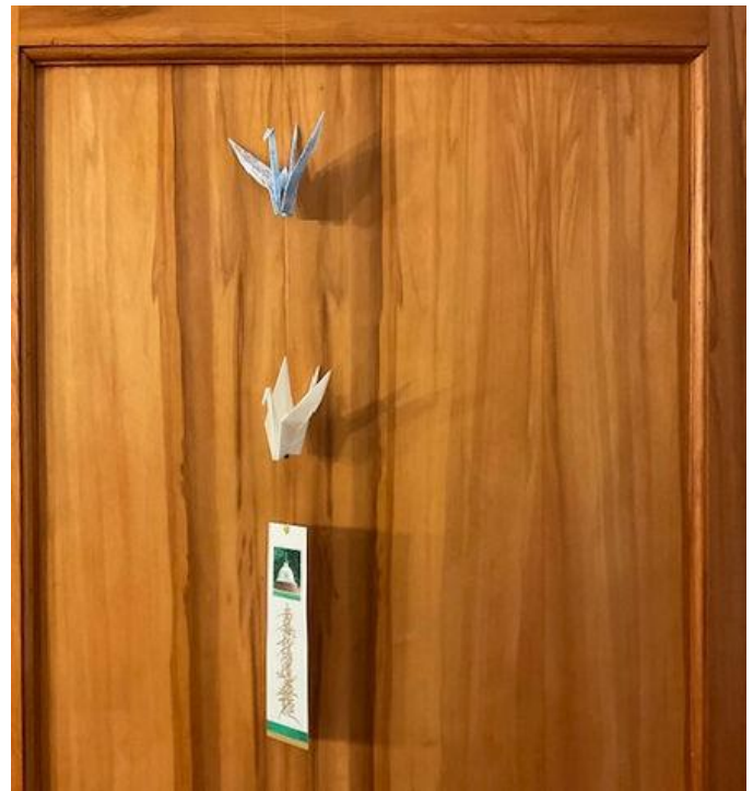
Photo at right: The two cranes in a mobile were presented to Great Spirit from the Peace Walkers. They walk to get the message out to the public, Abolish Nuclear Weapons & End all Wars! Their cranes symbolize hope and healing during challenging times.

Sunday Potlucks have become very popular, more people are staying for food and conversation. The Hospitality team appreciates the response for help preparing the meal and the clean-up afterward. This month the ice cream single-serve cups were a hit!