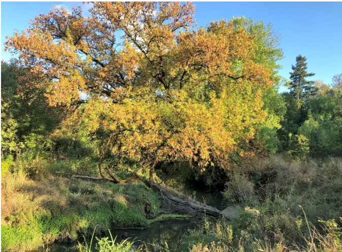
A tree in Autumn colors along Fanno Creek Trail last week.